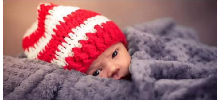
Knitting for the wee ones to give them a fighting chance to be future bowlers.

The BeezKnits first delivery was delivered yesterday along with some toys for the toddlers in the hospitals care.